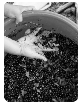
Harvesting wild organic blueberries on Sealaska Native Corporation land near Kake, AK.